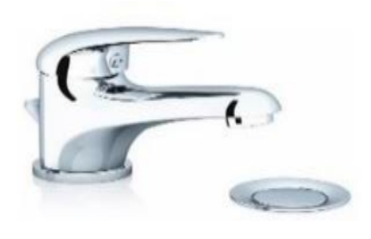
Washbasin Mixer Tap & Waste