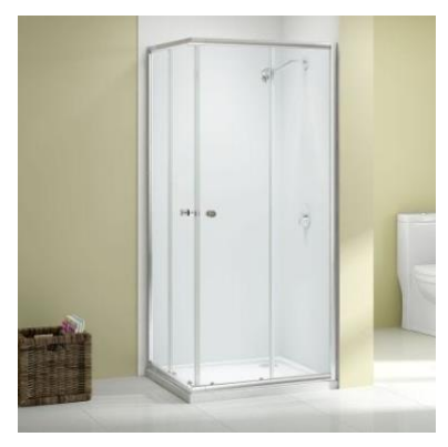
Shower Door Satin 900 x 900mm