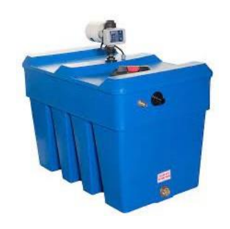
RTL31HS – Aquabox 300ltr with Booster Pump

Space heating provided by means of high efficiency aluminum radiators to all rooms.