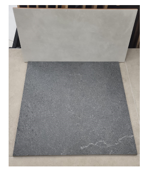
Bathroom Floor & Wall Tiles Colour/Style, floor tiles 450x450mm