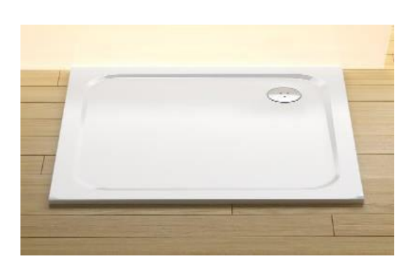
Dolomite Cast Shower Tray 800x800mm