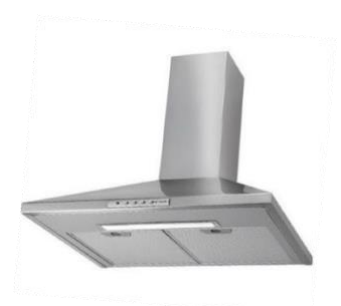
RTL62K - Cooker Hood