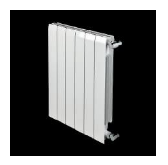
RTL29HS – High Efficiency Aluminum Radiator

RTL28HS – Split Air-to-Water Heat Pump c/w Hot Water Storage.