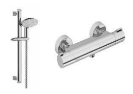
Thermostatic Showering Kit