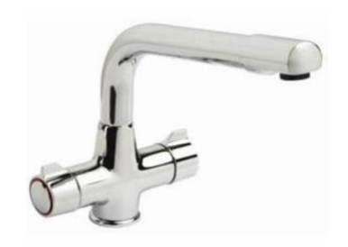
High Spout ¼ Turn Mixer Tap