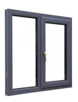
Triple- Glazed Anthracite Windows