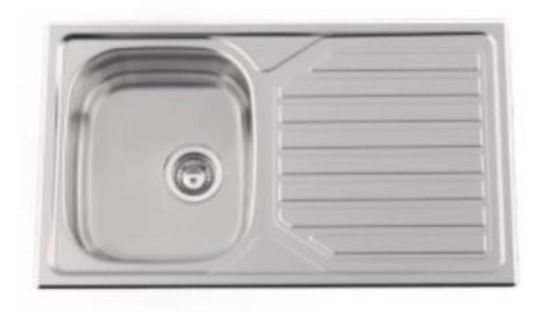
Single Bowl Sink & Drainer

Dust grey kitchen with shaker doors, wood worktop (handles and hood as above).