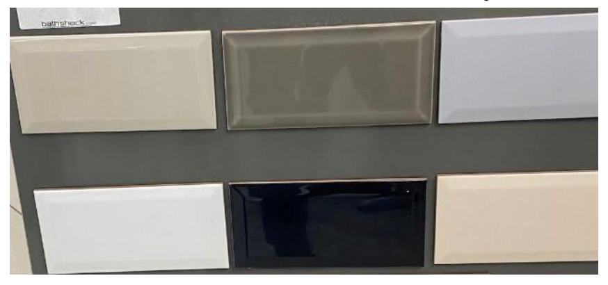
Kitchen Splash Back Tile Options 200x100mm